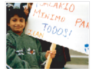
A young member of the Idaho Community Action Network/NWFCO carries a sign calling for minimum wage for all.

FIRM is managed by staff at the Center for Community Change - a nonprofit public policy and technical assistance organization based in Washington, D.C.