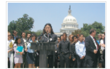
A Korean American youth and NAKASEC member speaks at a press conference on the DREAM Act during the 2002 Immigrant Youth Speak Out Day.