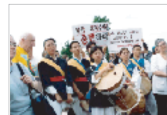
NAKASEC members rally at Middlesex Detention Center in New Jersey where detainees were being held under harsh health and sanitary conditions.