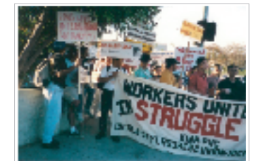
Members of CHIRLA and Day Laborer Union prepare to join the May Day march.