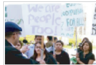
Student members of Latinos Unidos Siempre and CAUSA rally at the Oregon Capitol for passage of the DREAM Act.

FIRM is led by a coalition of grassroots community organizations working on behalf of immigration reform and immigrant rights. The coalition consists of organizing networks, statewide immigrant rights coalitions, and faith-based and low-income groups, and works in partnership with national organizations.