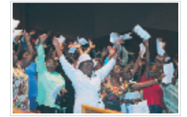
Haitian immigrants in Miami are among the members of People Acting for Community Together (PACT), one of the groups across the country who have come together to form FIRM.

FORGE key alliances with sectors that could advance the goals of the campaign, including business, community, faith, civil rights, African American and other organizations.