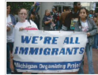
Two members of the Michigan Organizing Project hold up a banner pronouncing "We're All Immigrants."

PROTECTING the rights of refugees and asylees and ending the inhumane detention and warehousing of asylum seekers.